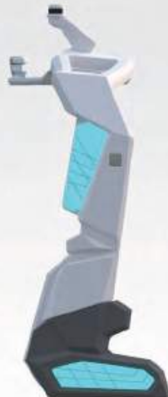
FLIGHT CONTROL TOWER MANUAL OR ACTUATED

Available on: G25 | G23 | G21 S25 | S23 | S21