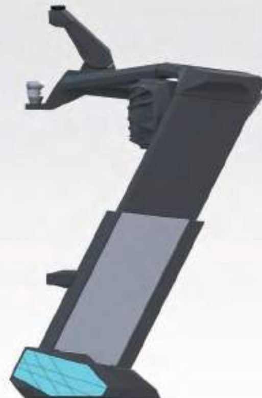
FLIGHT CONTROL TOWER TELESCOPING

Available on: G25 | G23 | G21 S25 | S23 | S21