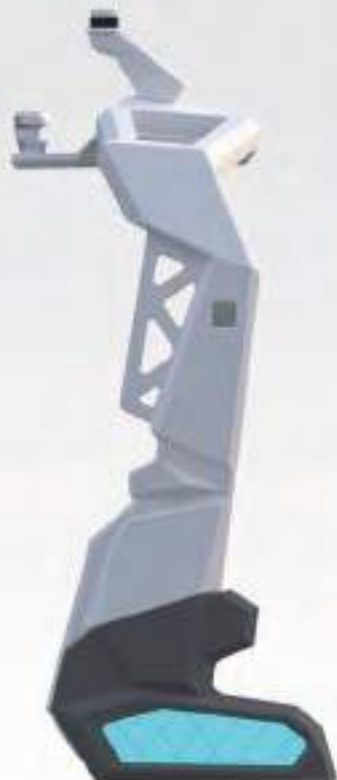
FLIGHT CONTROL TOWER ACTUATED