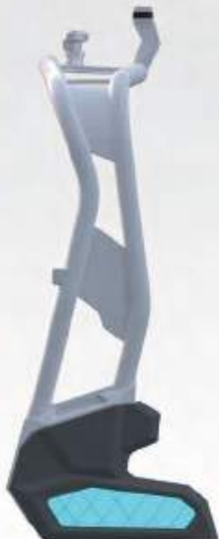
FLIGHT CONTROL TOWER MANUAL